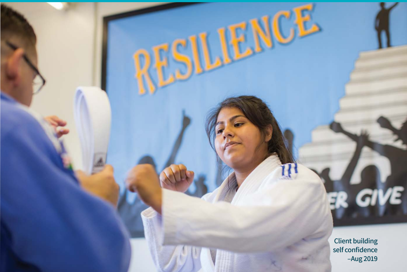
Client building self confidence —Aug 2019

the arrival of COVID-19. Many young people already struggle with depression and anxiety—challenges exacerbated by the fear and uncertainty associated with a public health crisis. The pandemic has isolated them from friends or other support structures and brought on the stress of family members facing unemployment. Such upheaval and trauma can lead to suicide threats or attempts, and other at-risk behaviors.